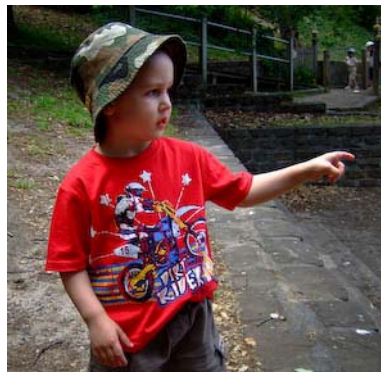
'The ball went that way'