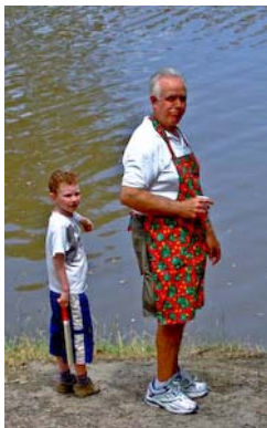
'There it is!'